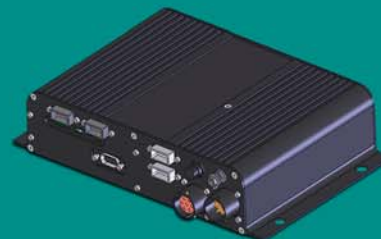
Power Supply Module